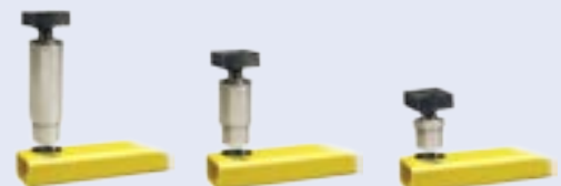
High Medium Standard

Our single piece adapter organizer prevents adapters from being misplaced.