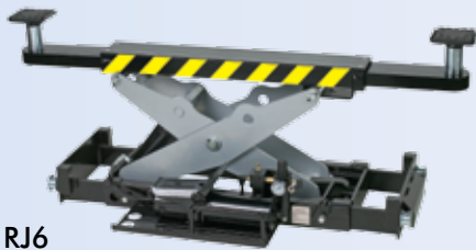
Part #: RJ6 6k lb. capacity Air/Hydraulic