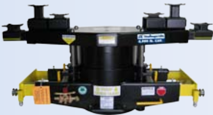
Part #: RJAB6 6k lb. capacity Air-Only