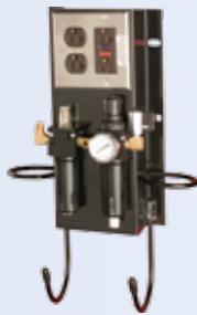
Part #: 10310

For more information, contact your Authorized Challenger Lifts Distributor.