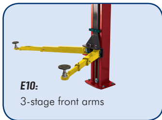
E10: 3-stage front arms